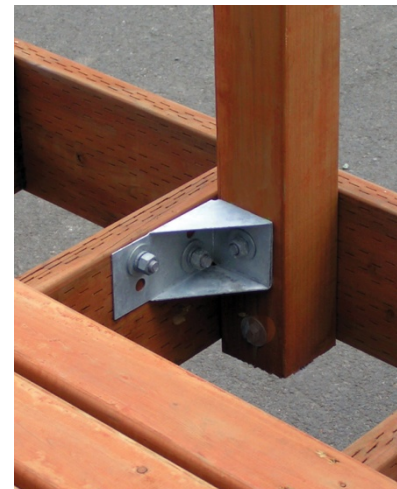
FIGURE 2—TYPICAL BRACKET INSTALLATION