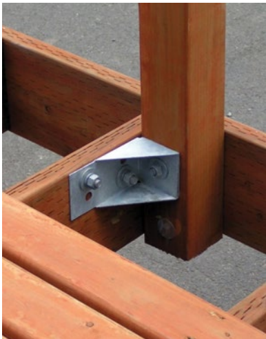
FIGURE 1—DeckLok connector Geometry and Dimensions